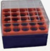
25 well rack