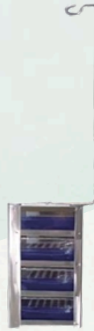
Square Canister for 81 well rack, four floor