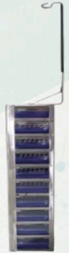
Square Canister for 81 well rack, ten floor